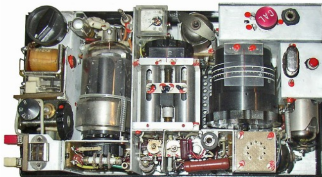
Top view of interior Sirius III transmitter unit.