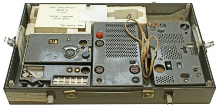
Sirius III (right) with mains power unit (centre), Měsíc keyer (bottom left), Merkur receiver (above the Měsíc keyer), accessories and spare parts packed for transit in a water-proof metal case.